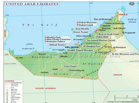
Fig. 2. Tourist sites in the UAE

communication and intellectual exchange of culture, customs and traditions among the peoples and a tool for creating manifold climate, tourism lead to improved relations between the countries, [1].